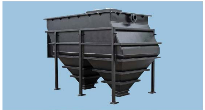
Rectangular SK-tank unit